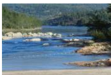
Trail, BC – Community Appearance Award Winner, presented by TECK

Community Appearance reflects an overall effort by the municipality, businesses, institutions and the residents throughout the community to create great first impressions and a sense that there is continuous attention and upkeep to critical elements of a community that benefit quality of life and economic vitality. Elements for evaluation are: parks and green spaces, medians, boulevards, sidewalks, streets; municipal, commercial, institutional and residential properties; ditches, road shoulders, vacant lots, signs and buildings; weed control, litter clean-up, graffiti prevention/removal and vandalism deterrent programs.