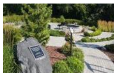
Melfort, SK - Landscape Award Winner, presented by Scotts® Turf Builder®

Landscape includes planning, design, construction and maintenance of parks, green spaces and cemeteries suitable for the intended use and location on a year-round basis. Elements for evaluation include native and introduced materials; biodiversity, materials and constructed elements; appropriate integration of hard surfaces and art elements, use of turf and groundcovers. Landscape design should harmonize the interests of all sectors of the community and provide safe and secure public spaces. Standards of execution and maintenance should demonstrate best practices, including quality of naturalization, use of groundcovers and wildflowers along with turf management.