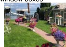
Cold Lake, AB – Plant and Floral Displays Award Winner, presented by the National Capital Commission

Plant and Floral Displays evaluates the efforts of the municipality, businesses, institutions and residents to design, plan, execute, and maintain plant and floral displays of high-quality standards. Evaluation includes the design and arrangements of flowers and plants (annuals, perennials, bulbs, ornamental grasses, edible plants, water efficient and pollinator friendly plants) in the context of originality, distribution, location, diversity and balance, colour, and harmony. It also pertains to flowerbeds, carpet bedding, containers, baskets and window boxes