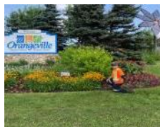
Orangeville, ON - Environmental Action Award Winner, presented by the Canadian Nursery and Landscape Association

Environmental Action pertains to the impact of human activities on the environment and the subsequent efforts and achievements of the community with respect to environmental stewardship, policies, by-laws, programs and best practices for waste reduction and landfill diversion, composting sites, landfill sites, hazardous waste collections, water conservation, energy conservation, and activities under the guiding principles of sustainable development pertaining to green spaces.