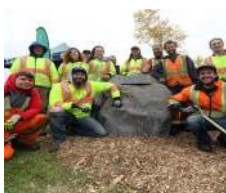
Brandon, MB - Tree Management Award Winner, presented by CiB

Tree Management Woodlands, Canopy Management, Urban and Rural Forestry includes the efforts of the municipality, businesses, institutions and residents with regards to written policies, by-laws, standards for tree management protection (selection, planting, and maintenance), long and short-term management plans, tree replacement policies, pollinator-friendly tree selection, tree inventory including heritage, memorial, and commemorative trees, and Integrated Pest Management (IPM) programs.