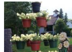
Millet, AB - Heritage Conservation Award Winner, presented by CiB

Heritage Conservation includes efforts to preserve and protect both natural and cultural heritage within the community. Preservation of natural heritage pertains to policies, plans and actions concerning all elements of biodiversity including flora and fauna ecosystems and associated geological structures and formations. Cultural conservation represents the “persona” of a community and refers to the heritage that helps define the community including the legacy of tangible elements such as heritage buildings, monuments, memorials, cemeteries, artifacts, museums and intangible elements such as traditions, customs, festivals and celebrations.