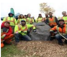
Brandon, MB - Tree Management Award Winner, presented by CiB

Tree Management Woodlands, Canopy Management, Urban and Rural Forestry includes the efforts of the municipality, businesses, institutions and residents with regards to written policies, by-laws, standards for tree management protection (selection, planting, and maintenance), long and short-term management plans, tree replacement policies, pollinator-friendly tree selection, tree inventory including heritage, memorial, and commemorative trees, and Integrated Pest Management (IPM) programs.