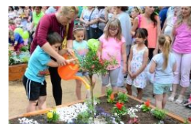
Székesfehérvár, Hungary - International Youth Involvement Award, presented by CiB