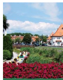
Mosonmagyaróvár, Hungary - International Community Involvement Award, presented by Communities in Bloom